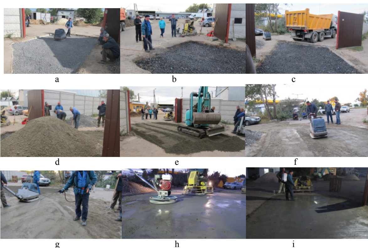
Fig. 4. Compacting of cement-concrete mixture using technology of roller-compacted cement-concrete in the experimental section: a-i – sequence of technological operations

After a set of 70–75 % concrete strength on the fourth day, the traffic was opened on a stretch of road laid with the roller-compacted cement mix.