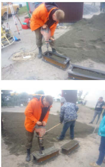
Fig. 2. Forming of a prism sample

On the construction site, prism samples were made in an inventory metal formwork measuring 15x15x60 cm, which were stored in conditions close to reality. The seal was carried out using a HILTI TE 76 perforator with a special packing (two layers 7–8 cm thick, Fig. 2).